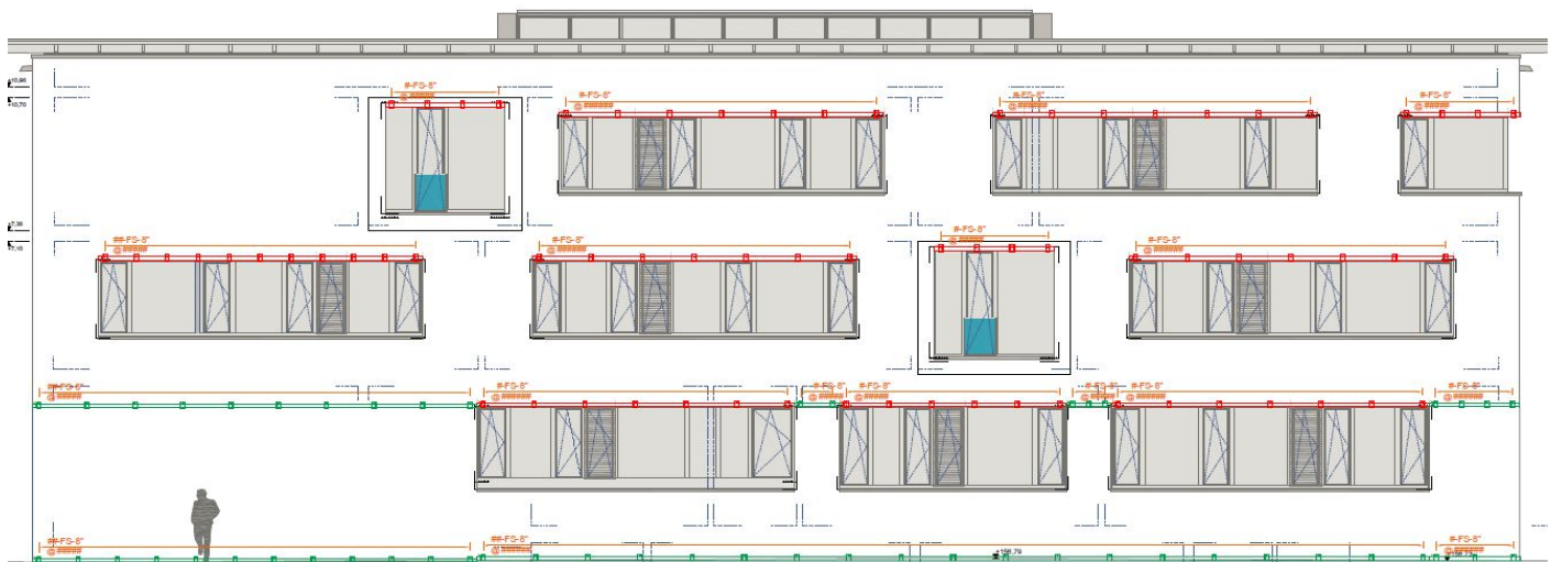
Installation-plan reference facade of the certified component (LC VI)